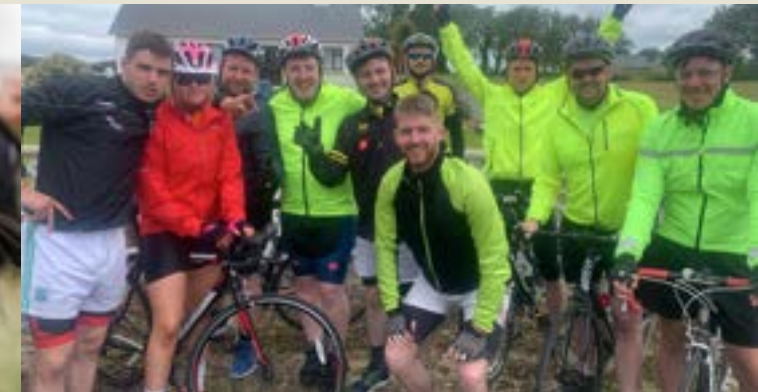
charity swims / cycles