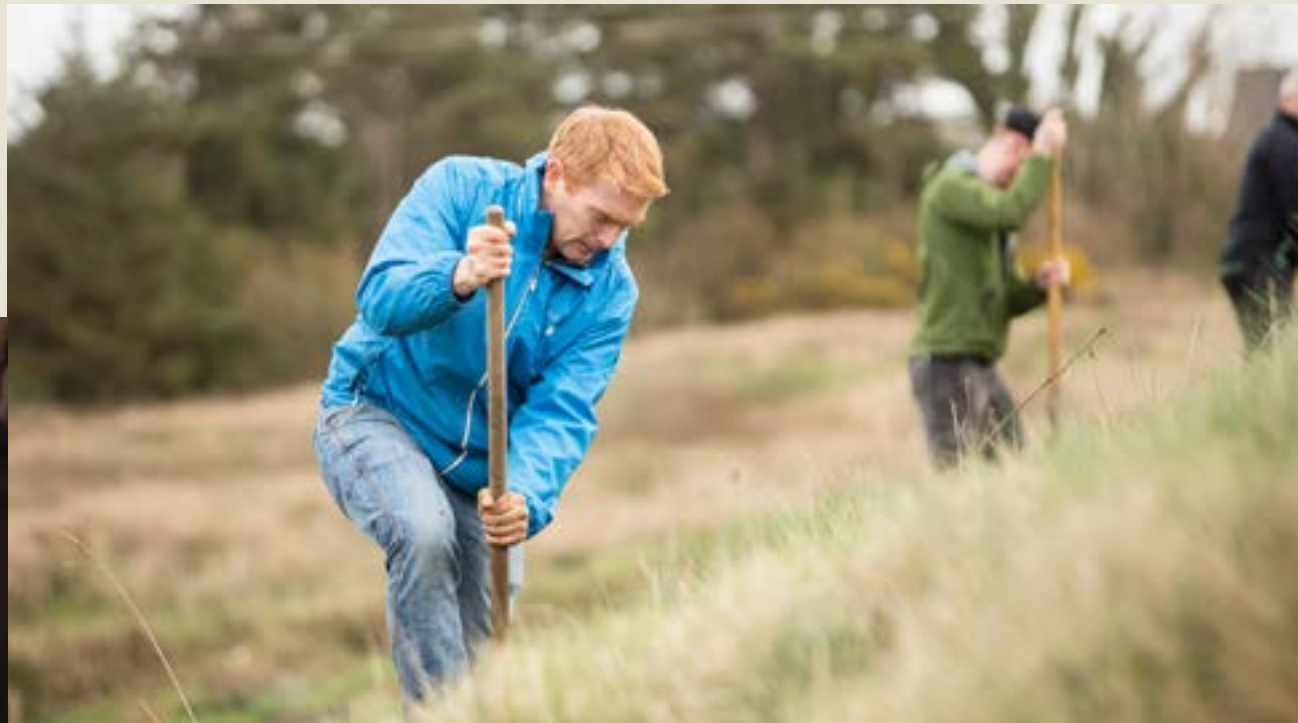
tree planting (carbon offsetting) & "no dig" farm tour