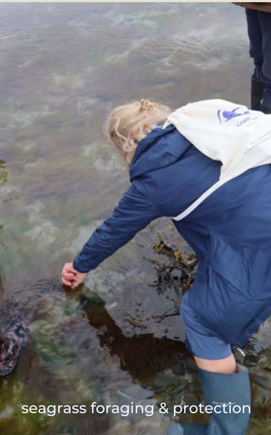
seagrass foraging & protection